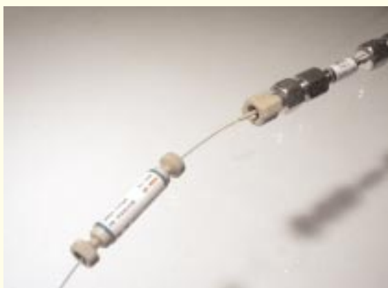
10x1.0mm Piccolo being used as a guard column for a 50x1.0mm analytical microbore column.

In addition to analytical microbore applications Piccolo columns are ideal guards for protecting longer microbore HPLC columns as illustrated below.